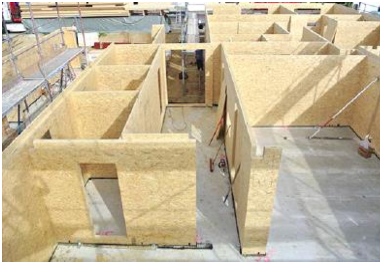
Layouts as wished or required with MAGNUMBOARD® OSB

The rooms of a building can also be freely placed, sized and configured entirely based on the owner's ideas and wishes. The walls are much thinner than with other construction systems, so there is more space to use. There can be spacious, open rooms or a larger number of smaller ones, depending on the needs and preferences of those who will later use or occupy the building. Every house built with MAGNUMBOARD® OSB is unique.