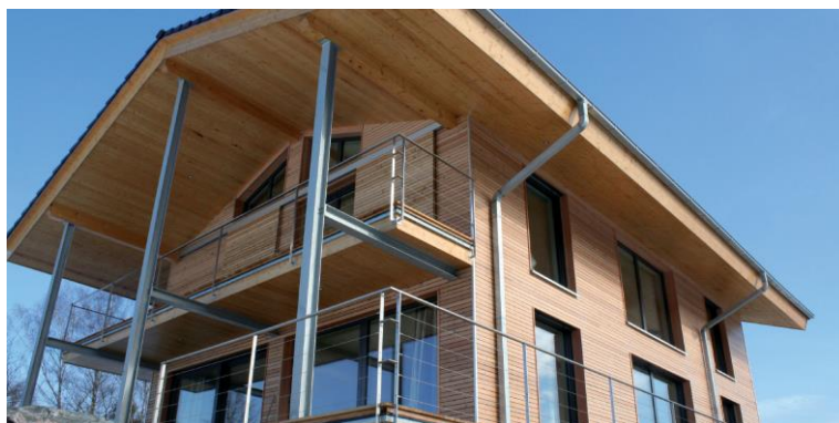
Exterior with wood-fibre insulation and boarding

In respect of exterior insulation and design, SWISS KRONO MAGNUMBOARD® OSB is also highly versatile: it doesn't matter whether an external thermal insulation composite system (ETICS), blown insulation, mineral wool or wood-fibre insulation is chosen, or plaster or a curtain wall with wood panelling – these and many other possibilities are no problem whatsoever.