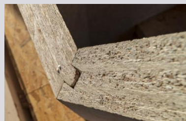
Connection details of lean constructions made of SWISS KRONO MAGNUMBOARD® OSB