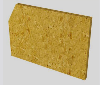
Exterior wall with F30 fire protection

You can download a number of descriptions of system modules for interior and exterior walls, including some for meeting greater-than-usual acoustic insulation requirements, here .